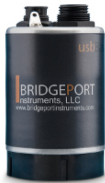
usbBase: eMorpho MCA + HV with USB & GPIO.

The usbBase is a PMT plug-on with a digital MCA, embedded high-voltage generator and divider.